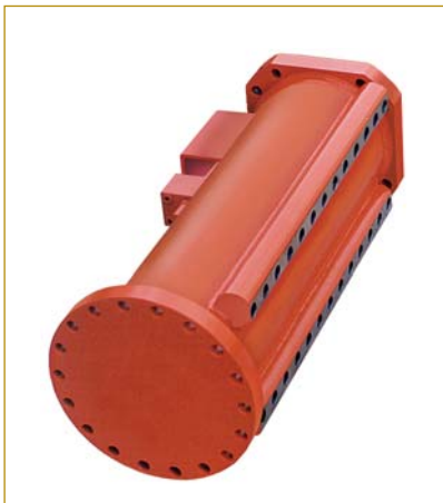
Model L30-95-S-RL-360-L1-C-H rotary actuator has drilled and tapped mounting rail on the housing. Sandvik uses the rail mounting style for other rotating applications.

The drill head assembly is attached to the actuator's octagonal rear mounting flange. The actuator's shaft remains stationary with the boom