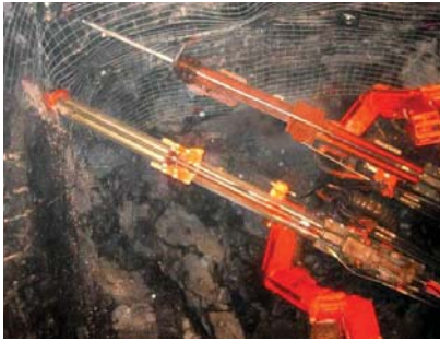
Twin booms, with drill heads on outboard ends, improve production.

The rotary actuators are integral parts of the machine, mounted in-line between the booms and drill heads. Their large, circular, integral shaft flange — with drilled and tapped bolt circle — is used to attach the actuator to the boom.